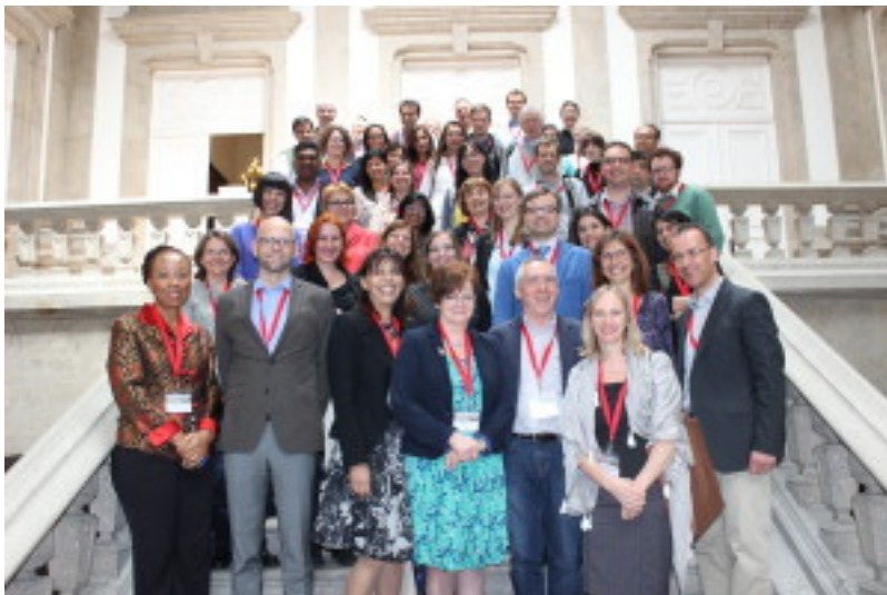
Participants of the COAR General Assembly

The COAR General Assembly was held in Porto, Portugal in April 2015 and presented the activities and operations of the association of the previous year and plans for the upcoming year. In addition, elections for the new Executive Board took place and the Executive Board was expanded from three to six members, reflecting the increasingly international nature of COAR with representatives from Europe, Latin America, North America and Africa.